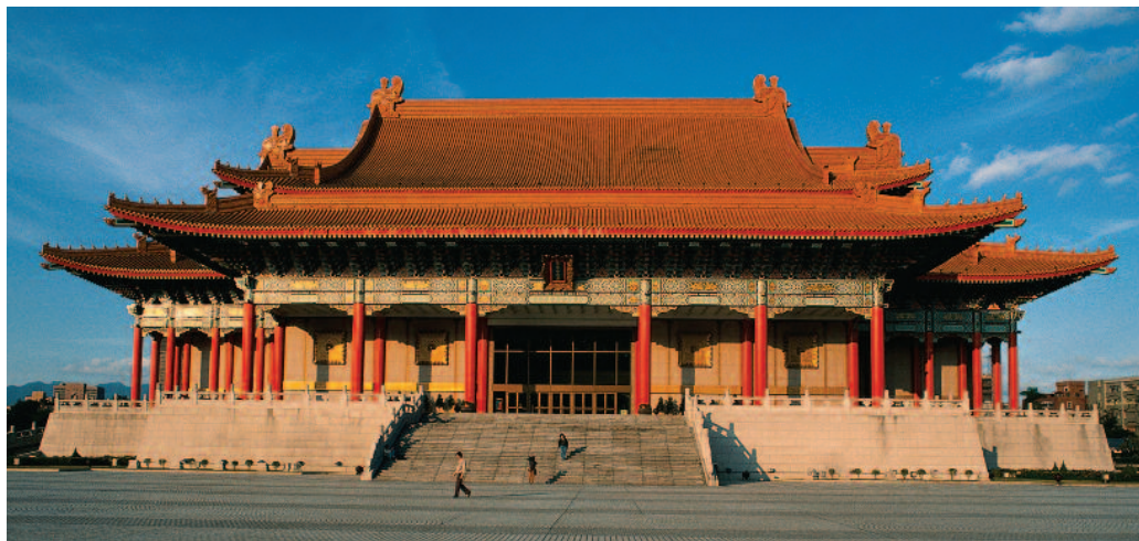
Tour the splendid Temple of Heaven complex on Day 5.

Sunday, September 9: Beijing/Xian This morning we fly to Xian, once among the world's greatest cities that devolved into a provincial backwater until the accidental discovery of the Terra Cotta Warriors in 1974 – considered among the most significant archaeological finds of the 20 th century. This afternoon we explore Xian's impressive nine-mile city wall and moat. Tonight we attend a Tang Dynasty dinner show. B,L,D