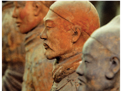
View Xi'an's amazing Terra-cotta Warriors

All Cabins: Private balcony; satellite TV with HBO