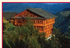
Li An Lodge