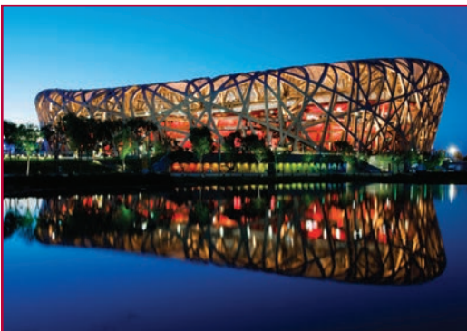
Bird's Nest, Beijing