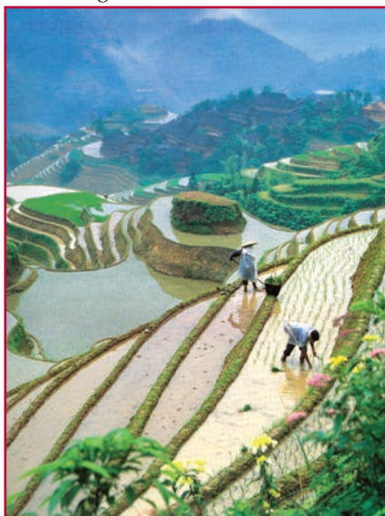
Longsheng Rice Terraces

Visit the National Silk Museum, where you will be amazed by the intricate production of silk.