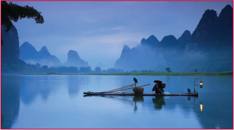
Cormorant Fisherman, Guilin