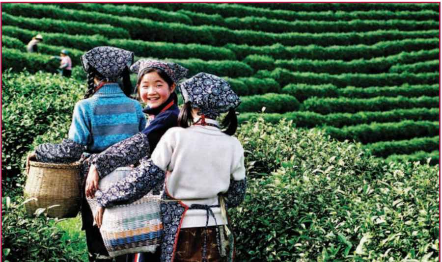
Tea Cultivation, Hangzhou

Prices are subject to change without notice.