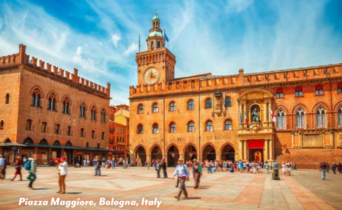
Piazza Maggiore, Bologna, Italy