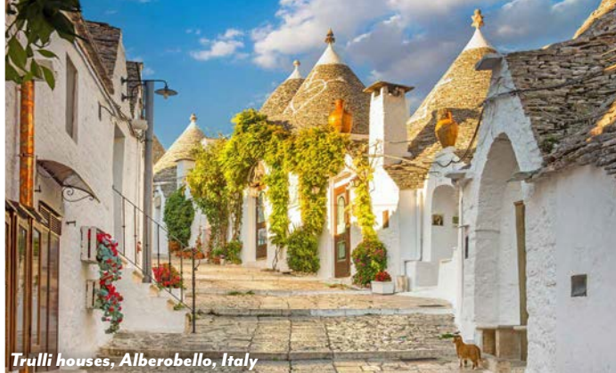
Trulli houses, Alberobello, Italy

Spend free time in chic Tivat before returning to the ship for dinner.