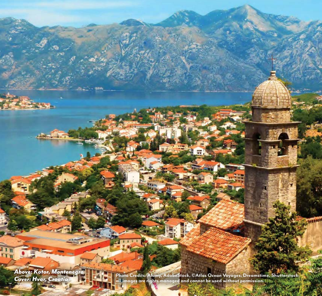
Above: Kotor, Montenegro Cover: Hvar, Croatia

Photo Credits: Alamy, AdobeStock, ©Atlas Ocean Voyages, Dreamstime, Shutterstock; all images are rights managed and cannot be used without permission.