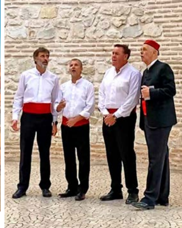
Croatian Klapa performers

the patron saint of Split, and the Temple of Jupiter. Today's excursion also includes exterior visits to the Golden Gate, Silver Gate and Peristyle Square.