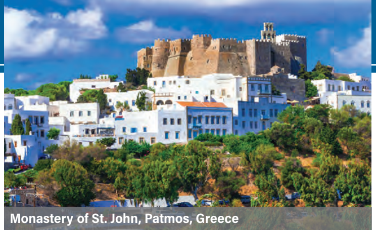
Monastery of St. John, Patmos, Greece

a donkey ride, we will ascend to the top of the acropolis to visit its monuments, admire the incredible view, and walk the narrow alleyways of the village. (B,L,D)