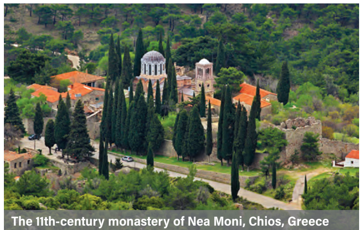
The 11th-century monastery of Nea Moni, Chios, Greece