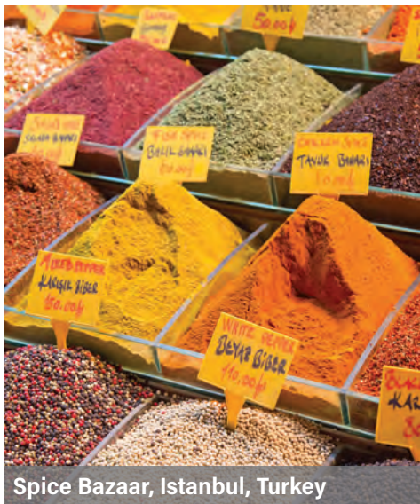
Spice Bazaar, Istanbul, Turkey

NOT INCLUDED: Airfares for international flights; travel insurance; expenses of a personal nature; any items not mentioned in the itinerary or the above inclusions.