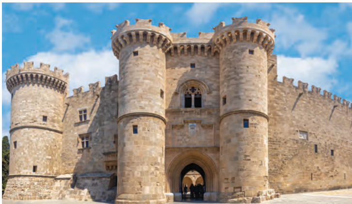
The Palace of the Grand Master, Rhodes, Greece

Founded by Greeks in the 7th-century BC and named Byzantium, in AD 324, Emperor Constantine made the city the capital of the Roman Empire, naming it after himself, Constantinople. For over 1,000 years, it was the capital of the Byzantine Empire. Renowned as the most resplendent city in Europe, in the 15th-century, it was taken over by the Ottoman Turks, making it the capital of the Ottoman Empire. Spend the day touring the city's principle historic monuments, including the Byzantine Church of Hagia Irene; the Topkapi Palace, the sumptuous palace of the sultans for three centuries; the Sultan Ahmed Mosque, also known as the Blue Mosque; the Hippodrome; the underground Basilica Cistern; and the colorful Spice Bazaar. Diana will sail in the evening. (B,L,D)