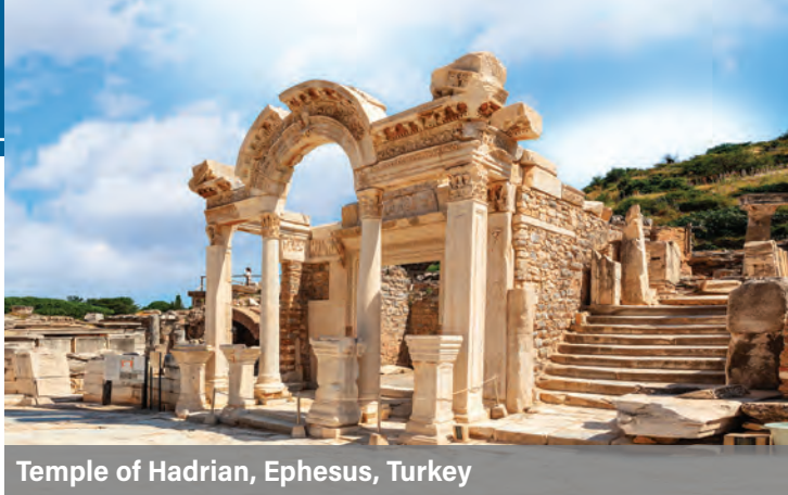
Temple of Hadrian, Ephesus, Turkey