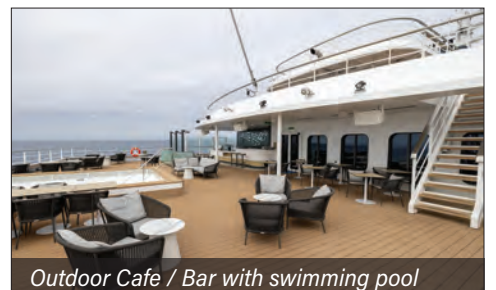
Outdoor Cafe / Bar with swimming pool

Constructed in Finland and launching in April 2023, Swan Hellenic's Diana is a new-generation expedition cruise ship. Although at 12,100 tons the ship is large enough to accommodate more than 350 passengers, Diana will accommodate a maximum of 192 guests in 96 spacious staterooms and balcony suites. The low guest density results in one of the most generous indoor and outdoor space-to-guest ratios among cruise ships.