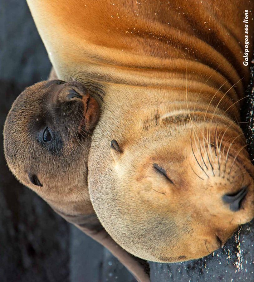
Galápagos sea lions

PRSRT STD U.S. Postage PAID Gohagan & Company