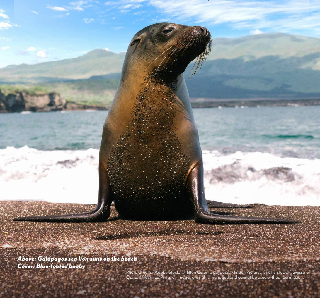
Above: Galápagos sea lion suns on the beach