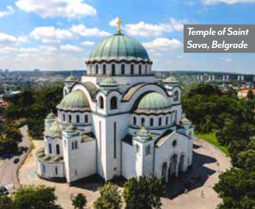
Temple of Saint Sava, Belgrade