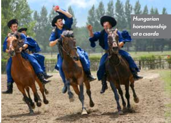
Hungarian horsemanship at a csarda

Continue to Veliko Târnovo's historical town center and see the 12 th -century Tsarevets Fortress.