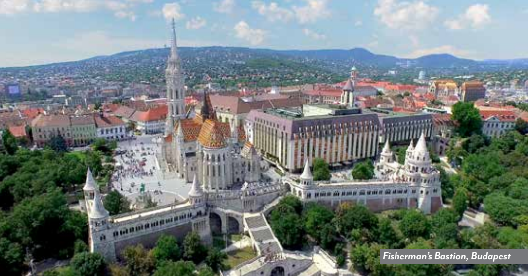
Fisherman's Bastion, Budapest