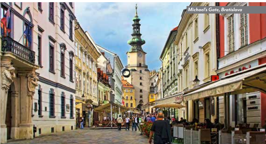
Michael's Gate, Bratislava