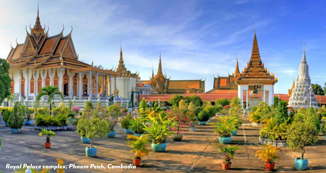
Royal Palace complex, Phnom Penh, Cambodia

friendly conversations with the villagers. Later, visit Prek Bangkong, known for its silk-weaving community. Observe artisans and weavers, and learn about the intricate silk production process.