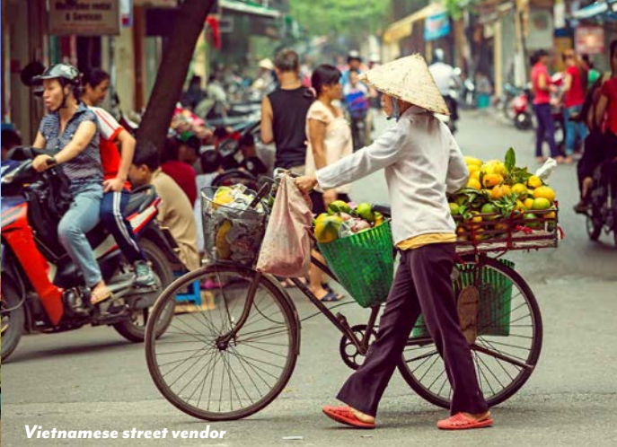
Vietnamese street vendor