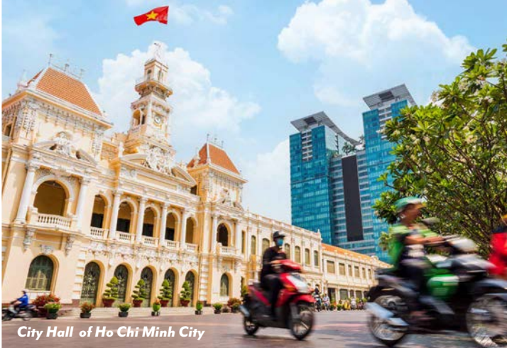
City Hall of Ho Chi Minh City