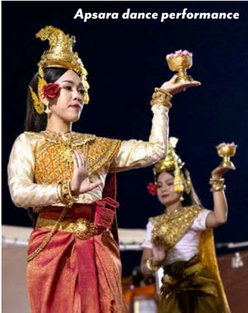
Apsara dance performance

In Angkor Ban, visit the local monastery and its delightful village, meet monks during their morning class, and engage in