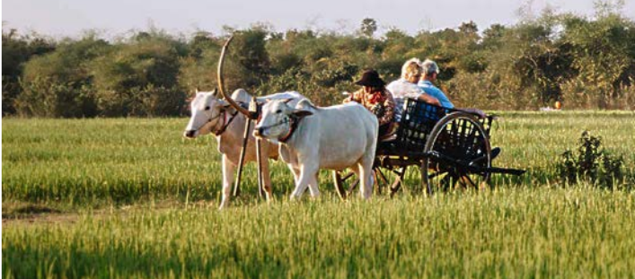
Ox-pulled cart, Tonle region, Cambodia