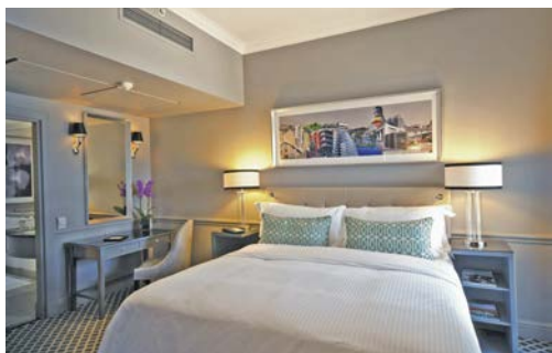
54 on Bath | Johannesburg