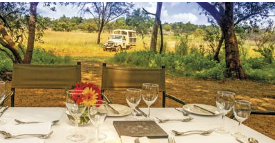
Below: Dining in the bush

For more than half a century, our dedicated team has helped travelers explore the world safely and securely.