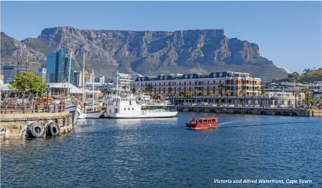
Victoria and Alfred Waterfront, Cape Town

Cape Town is a showcase of Cape Dutch houses and inspiring landmarks, including Robben Island and St. George’s Cathedral. Across the country, Soweto, once the main battleground in the war on apartheid, now offers opportunity and hope for a better future. No trip to southern Africa would be complete without a safari in its greatest parks and game reserves. Experience the thrill of up-close encounters with lions lazing in the grass after a kill or elephants quenching their thirst by a watering hole, and feel the power of thundering Victoria Falls.