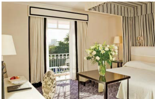
Belmond Mount Nelson Hotel | Cape Town