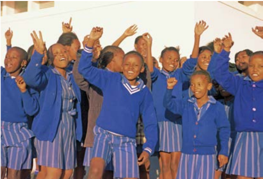
Soweto youth group