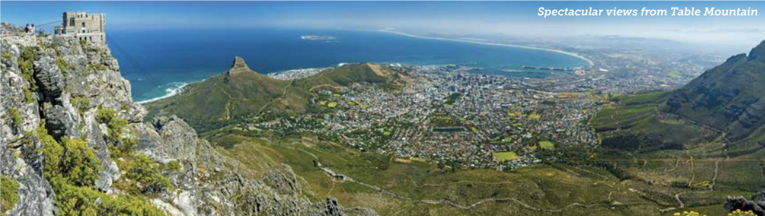
Spectacular views from Table Mountain