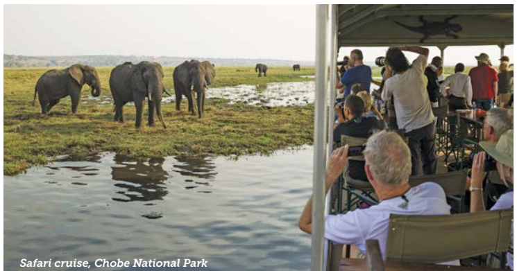
Safari cruise, Chobe National Park