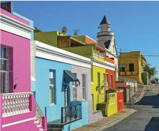
Colorful Bo-Kaap, Cape Town

Sheltered by Table Mountain, South Africa’s Mother City is one of the world’s most beautiful cities. Centuries-old Cape Dutch houses and colorful gardens dot the cityscape. A bustling waterfront welcomes visitors with inviting cafés and boutiques set amid workaday harbor life.