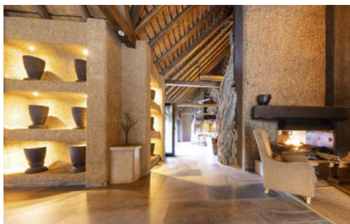
Kapama River Lodge |