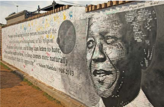
Nelson Mandela mural, Soweto

Note: Itinerary may change due to local conditions.