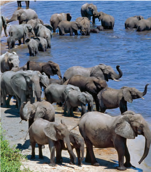
Elephants abound at Chobe.

Sunday, October 11: Arrive U.S. We arrive in the U.S. today and connect with our flights home.