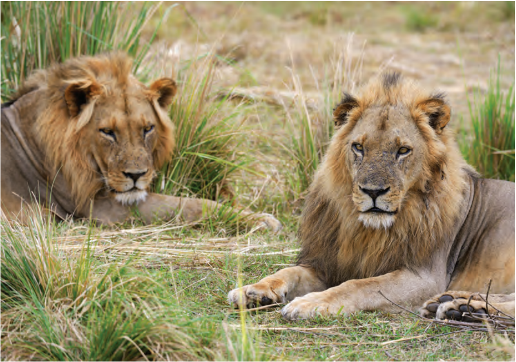
Lions lounging in their natural habitat.

lions, hippos, giraffes, impalas, wildebeests, buffaloes, and more. We're sure to see some of them on today's full-day excursion to Chobe, where we take a morning game drive and an afternoon game cruise. B,L,D