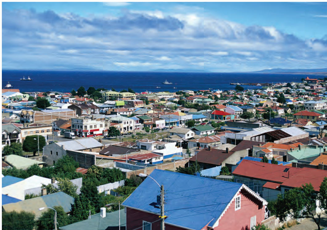
Our tour begins in grand Punta Arenas.

thunderous waterfalls. We also visit magnificent Lago Grey, which is fed by the glacier of the same name in the Southern Patagonia Ice Field. B,L,D