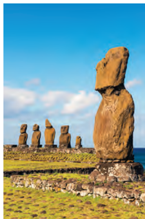
Easter Island’s moai (pre-tour option)

Thursday, January 25: Buenos Aires/Depart for U.S. This morning we tour Teatro Colon, Buenos Aires’ beloved opera house that ranks as one of