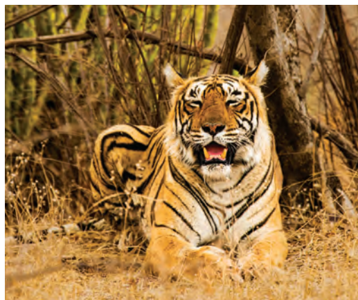
Bengal tiger rests in Ranthambore.

Sunday, November 5: Varanasi Early this morning we return to the Ganges where Hindu pilgrims perform their rituals along the ghats (steps) leading to the river. We visit several ghats by boat as we experience for ourselves the spiritual aura of the hallowed Ganges waters. Then we return to our hotel with time to rest before this afternoon’s walking tour