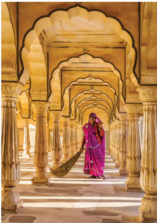
We explore Jaipur’s Amber Fort on Day 6.

and private performance of classical sitar. Tonight we celebrate our journey at a farewell dinner at our hotel. B,D