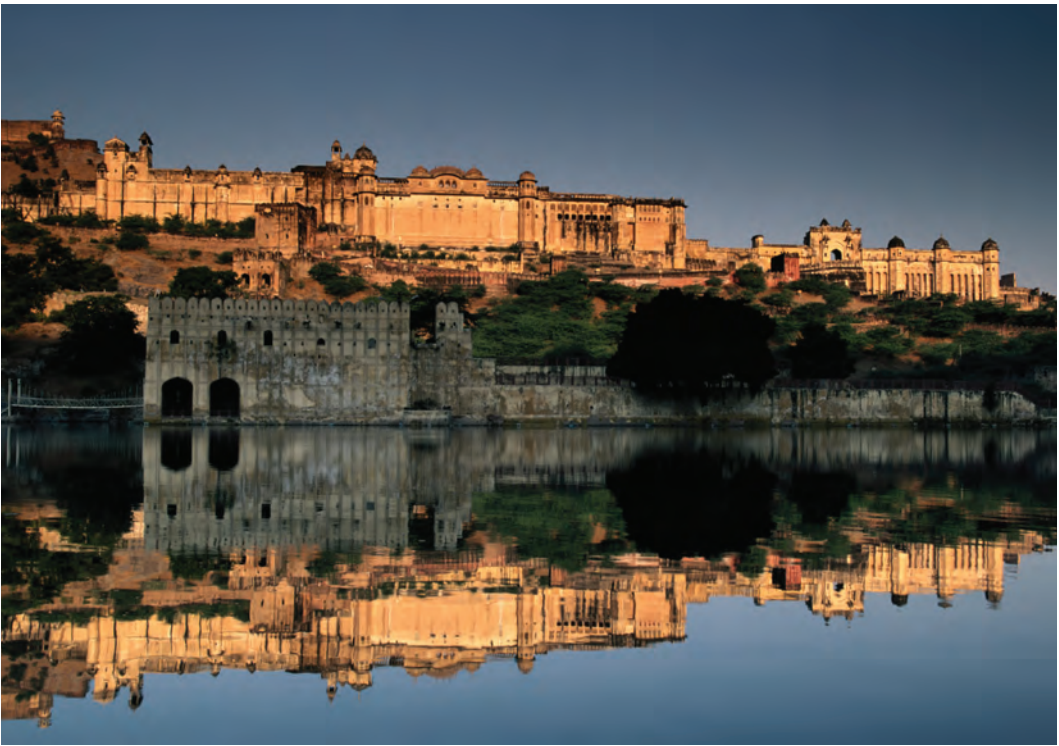
Visit Amber Fort, a UNESCO World Heritage site, on Friday, October 27.

block printing and handmade paper industries. Later we see local life up close as we explore an outdoor market. Tonight we are dinner guests in the home of a multi-generational Rajasthan family. B,D