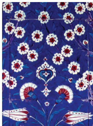
Exquisite Iznik tiles

Sunday, May 31: Antalya We discover Antalya’s charming old city (Kaleici) on a morning walking tour through its narrow streets, past historic build-