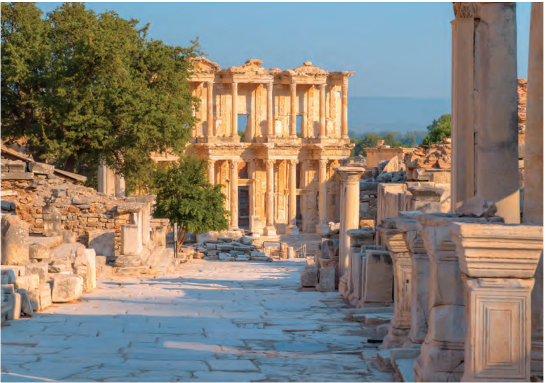
Celsus Library, Ephesus

Sunday, May 24: Istanbul/Gallipoli/Canakkale Leaving Istanbul this morning, we travel to the northern Aegean Coast for a brief visit to Gallipoli, haunting site of 31 Allied cemeteries from World War I. Then we ferry across the Dardanelles to Troy, once believed to exist only in Homer’s epic poem until the present site was discovered in the 1870s. After touring here, we continue on to Canakkale, where we spend the night. B,L,D