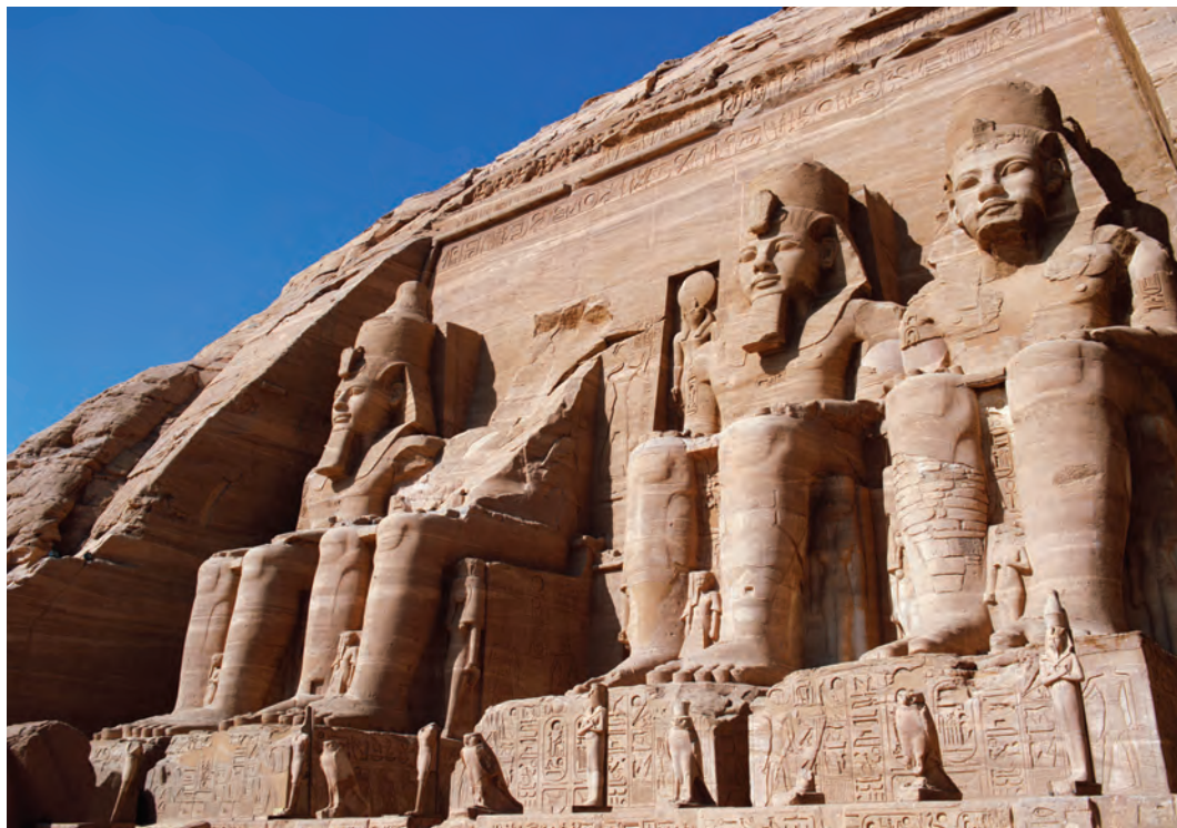
The magnificent temples at Abu Simbel commemorate Ramses II and his queen, Nefertari.

go ashore here), then sail to Amada, followed by Wadi el-Seboua. B,L,D