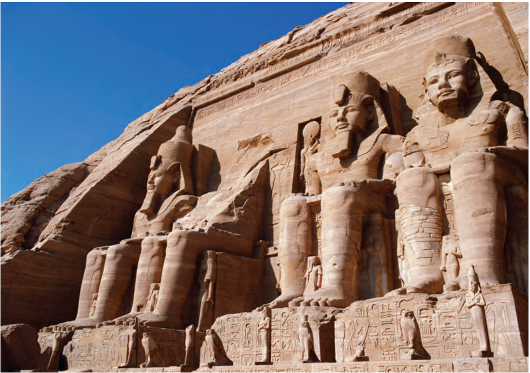
The magnificent temples at Abu Simbel commemorate Ramses II and his queen, Nefertari.

avenue of sphinxes in Wadi el-Seboua’s “Valley of the Lions” then cruise to Aswan. B,L,D