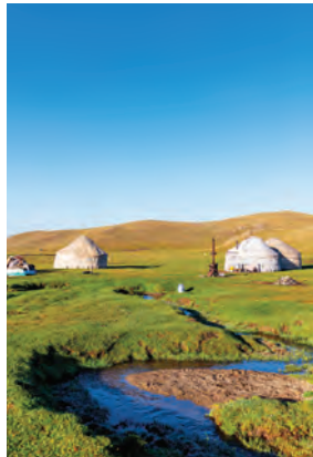
Typical Kyrgyz yurts

Necropolis and temple complex. This evening, we visit the Gur Emir Mausoleum, Tamarlane’s resting place, before dinner at a local restaurant. B,L,D