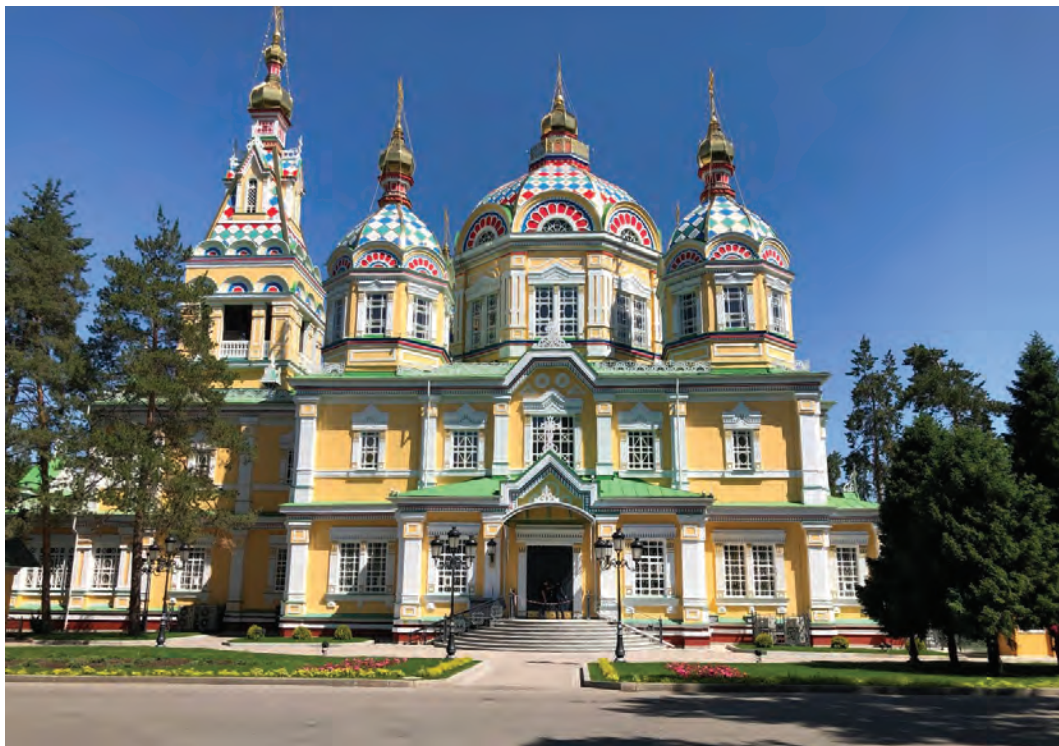
Almaty's Ascension Cathedral, which we visit on May 9

Monday, May 10: Almaty/Tashkent, Uzbekistan We fly this morning to the Uzbek capital of Tashkent, where this afternoon we visit the Museum of Applied Arts, housing fine examples of Uzbek crafts, including embroidery, jewelry, ceramics, and carpets. We have free time this afternoon before dinner at a local restaurant. B,L,D