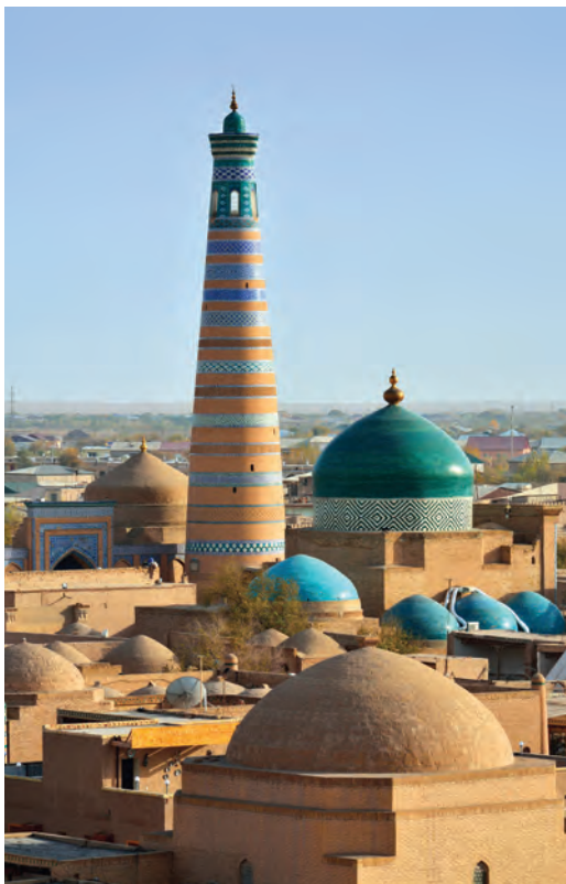
Cityscape of Khiva, historic Khorezm

ceramicist Akbar Rakhimov. Tonight, we toast our adventure along the Silk Road at a farewell dinner. B,D