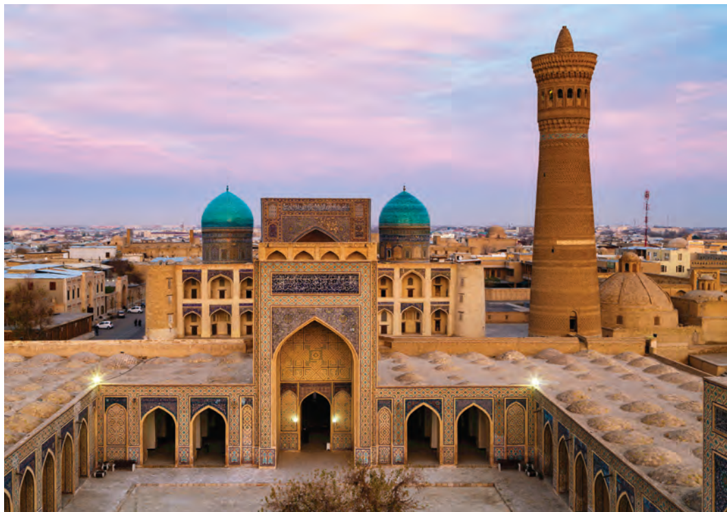
Poi Kalyan, a religious complex located in Bukhara, at sunset

Arts, housing fine examples of Uzbek crafts, including embroidery, jewelry, ceramics, and carpets. After checking in at our hotel, we have free time this afternoon before dinner at a local restaurant. B,L,D