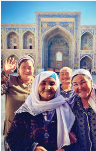
Welcoming people greet us along the Silk Road.

Monday, November 2: Samarkand Our discovery of this crossroads of culture continues today at the Afrasiyab Museum, a huge archaeological site and museum depicting the city's 2,500-year history; 15 th -century Ulugh Beg Observatory, one