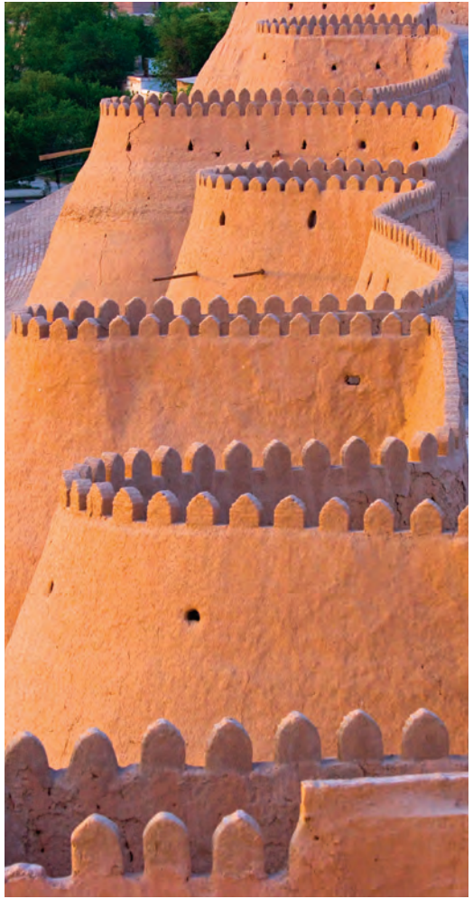
Khiva's city walls

Wednesday, November 4: Depart for U.S. Early this morning we depart for the airport for our connecting flight to the U.S.