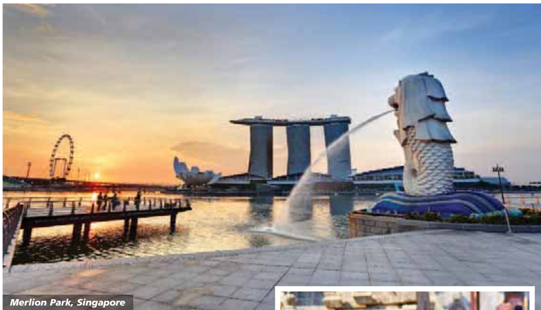
Merlion Park, Singapore