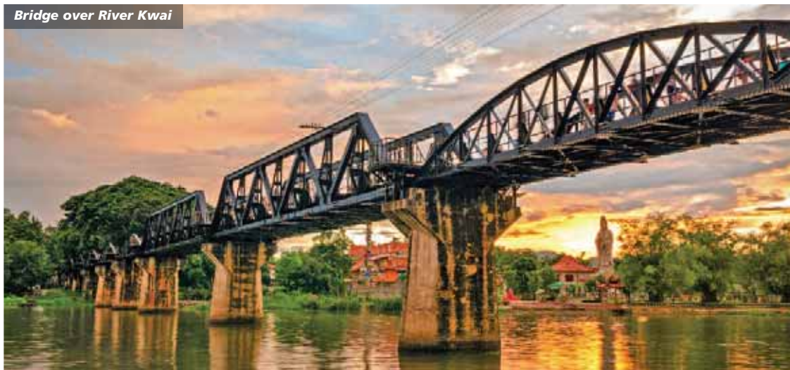
Bridge over River Kwai

For further details, please contact Club Travel at 415-597-6720, or email us at travel@commonwealthclub.org .