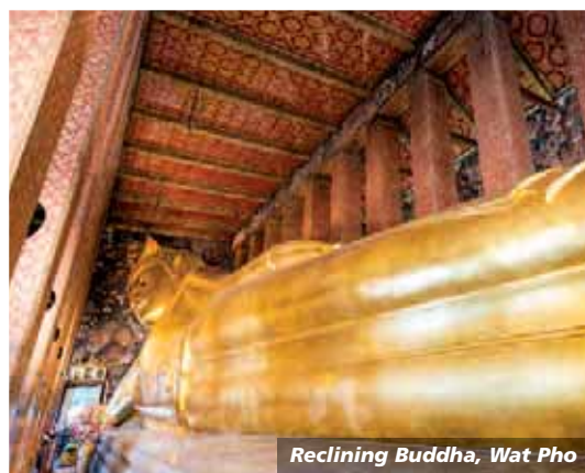
Reclining Buddha, Wat Pho