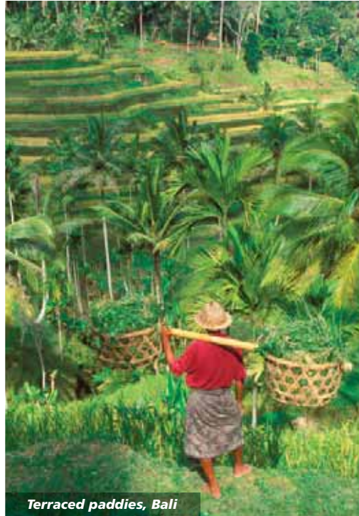
Terraced paddies, Bali