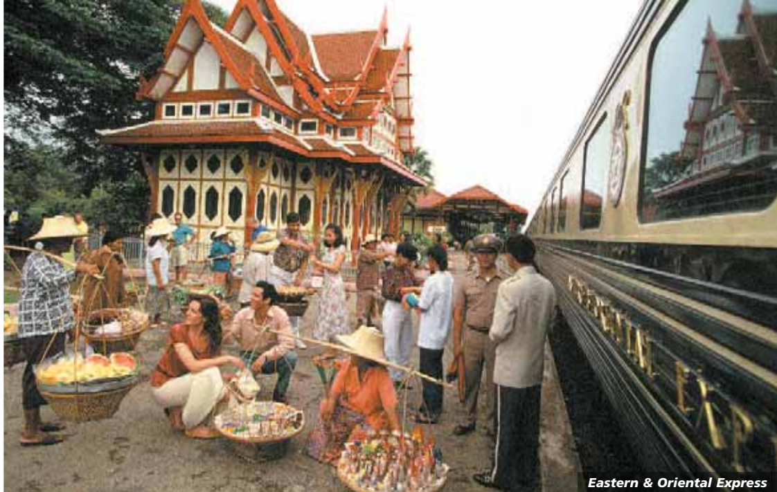
Eastern & Oriental Express