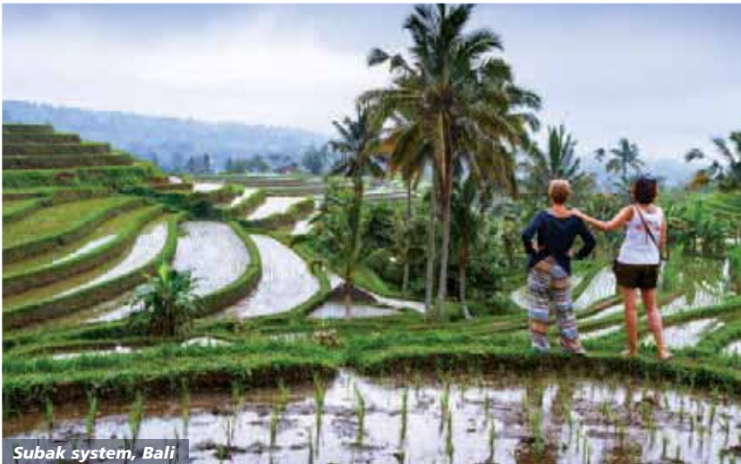
Subak system, Bali